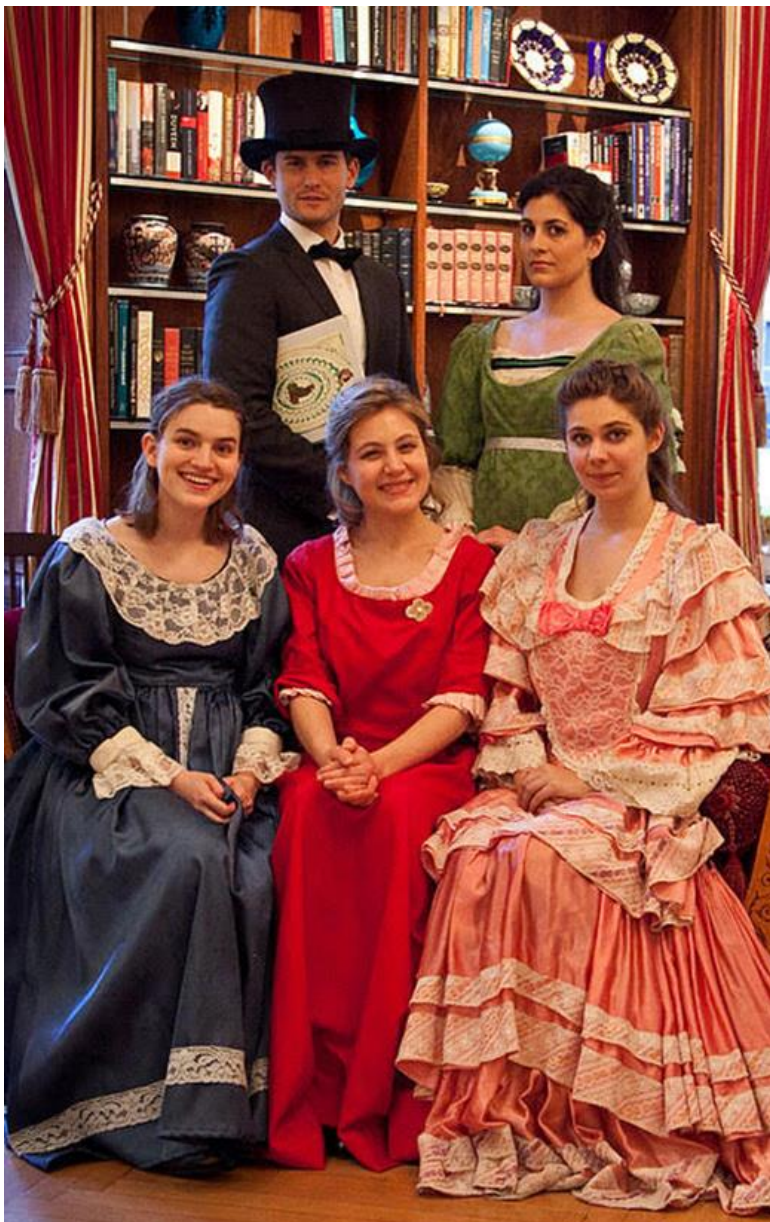
Photos from a previous production of Miss Valentine