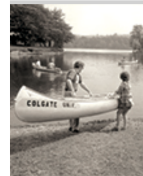
The Great Outdoors